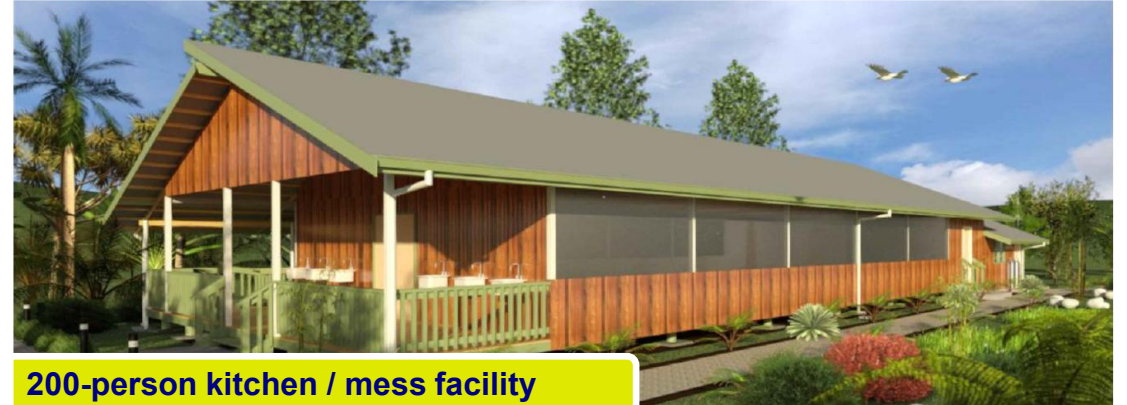
200-person kitchen / mess facility