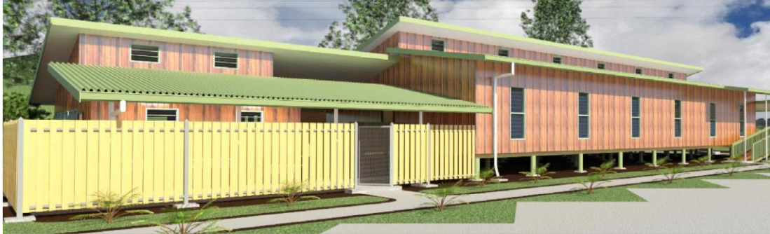
2 x 46 person dormitories – female / male