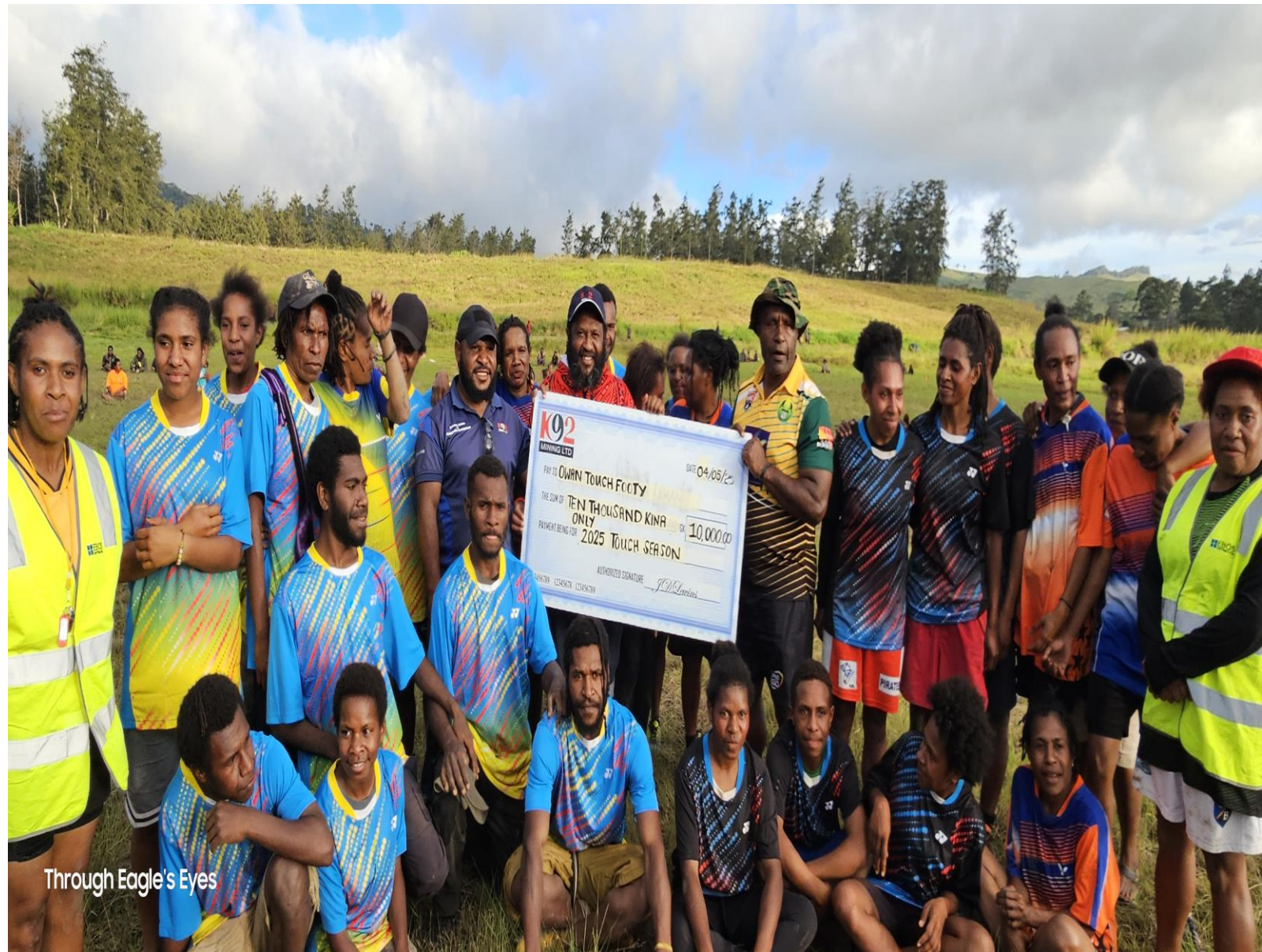
Aiyura Touch Football Team Presentation