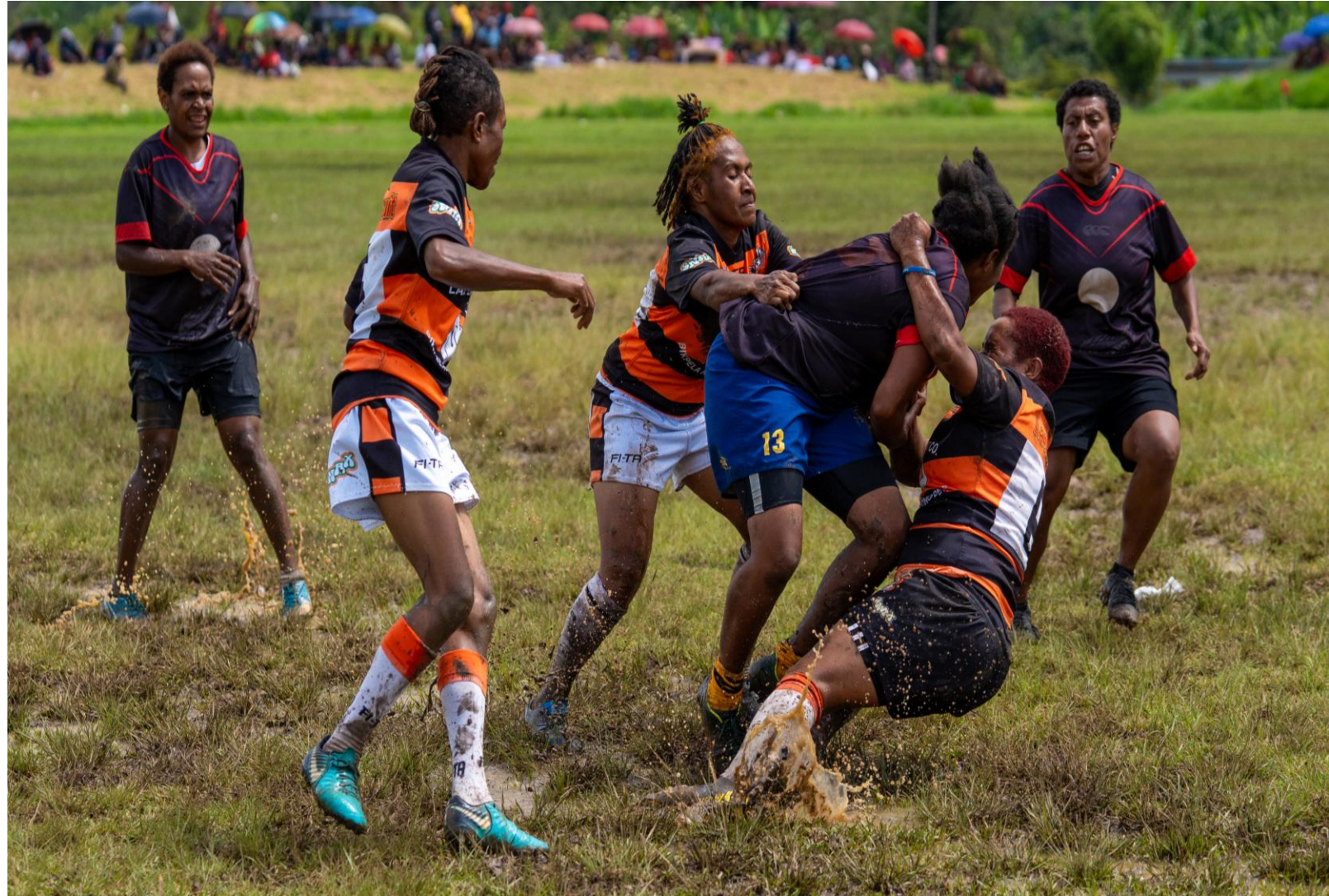
K92 Mining Rugby 9s, 2023 Competition