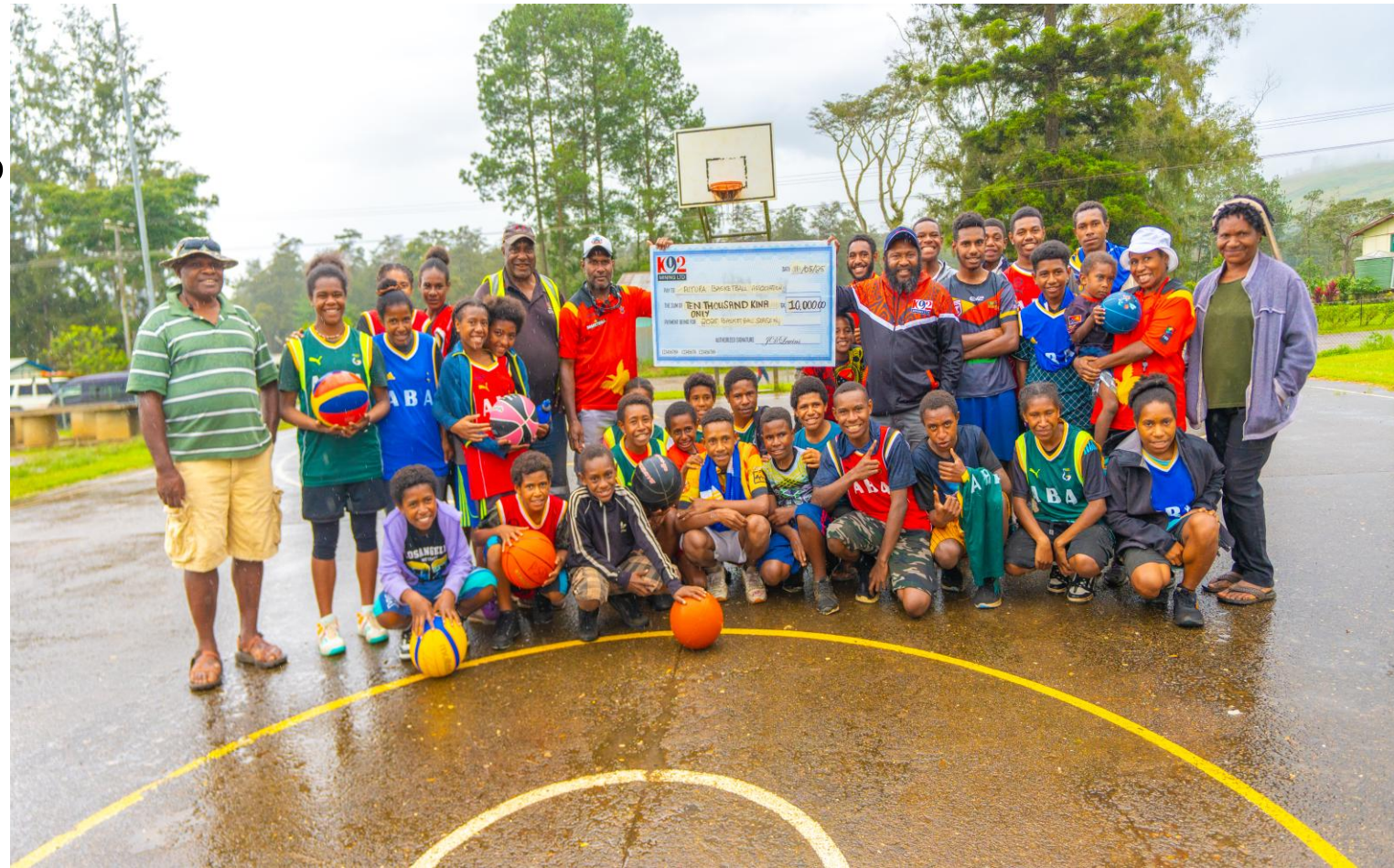
Aiyura Basketball Presentation 2025 Season

To date about 1 Million Kina has been spent over 4 years.