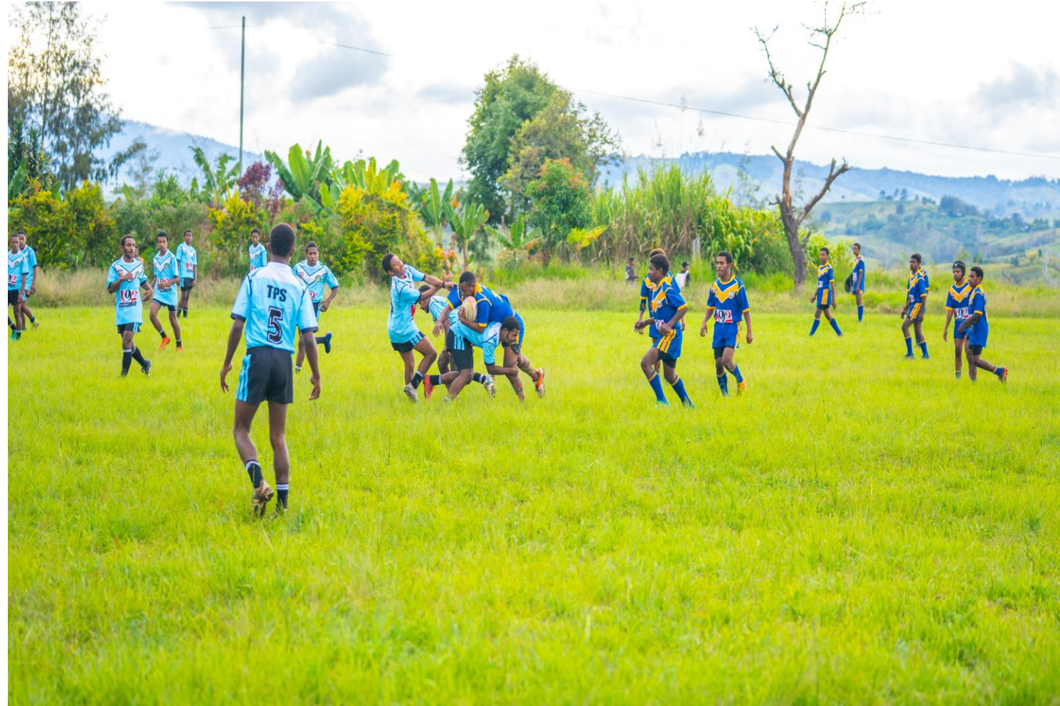
Kainantu School Boys Rugby Competition, 2025.