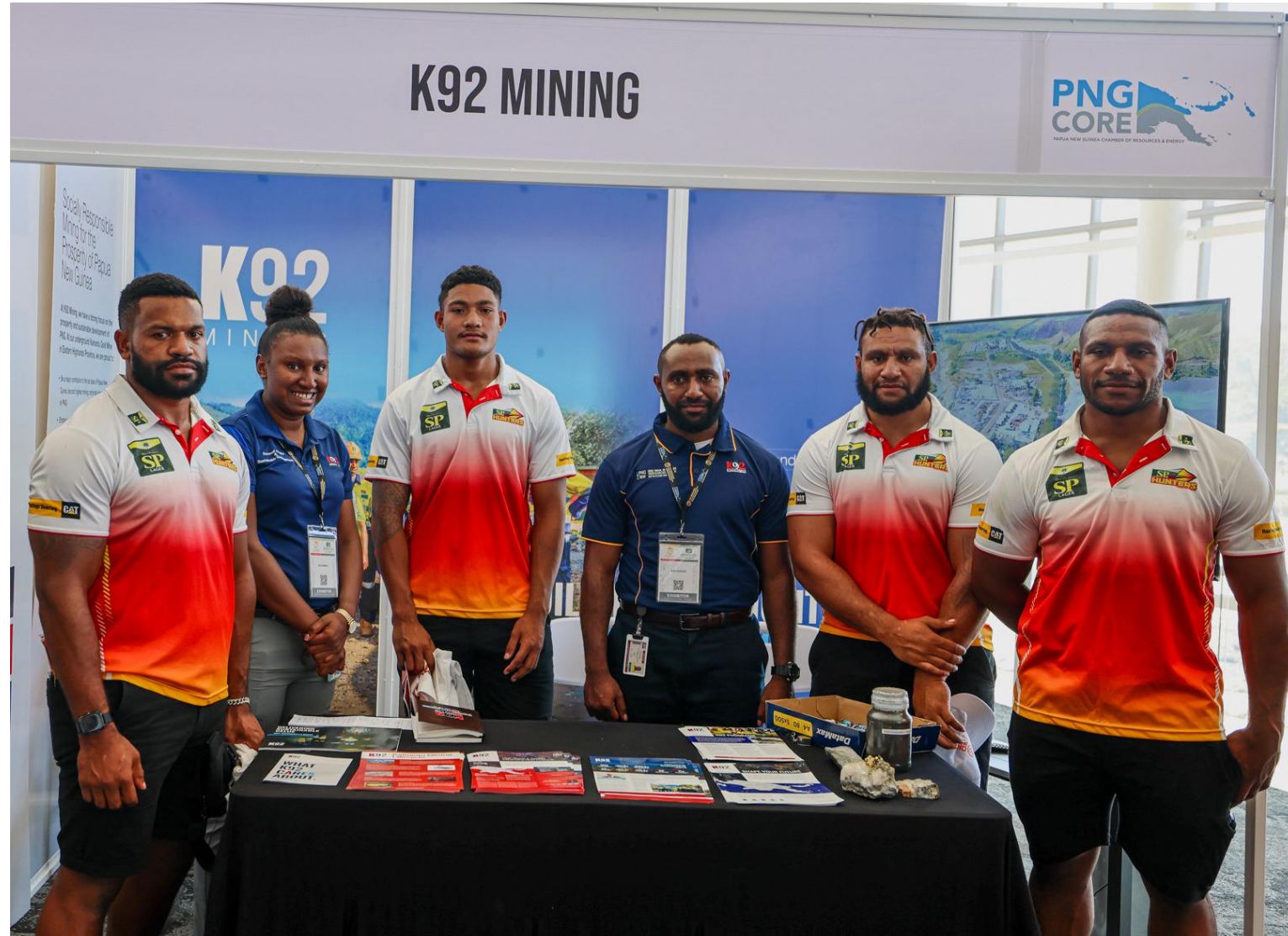
PNG Hunters players visit the K92 booth during Golden Exhibition, APEC Haus.