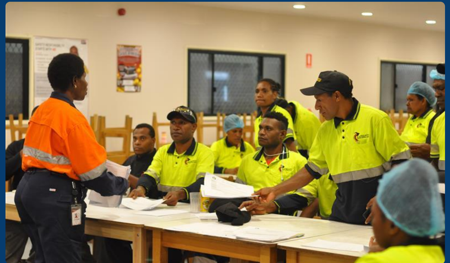
Continuous staff upskilling through training

“We train for the future of Papua New Guineans — not for short-term employment.”