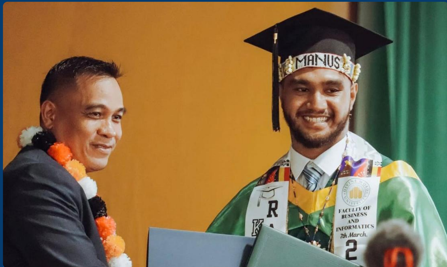
Graduate Internship Program

SKILLS ARE KEY TO SUSTAINABLE PARTICIPATION INITIATIVES